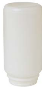
690 1 QT Screw-On Poultry Jar