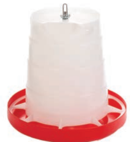
DPHF11 Deluxe 11 LB Poultry Feeder