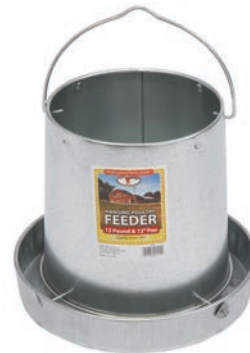
9112 12 LB Hanging Metal Poultry Feeder