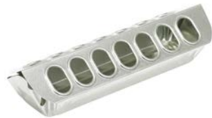
9814 12" Metal Slide-Top Poultry Ground Feeder