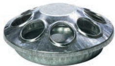
9808 Round Metal Chick Feeder