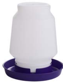
7506 1 GAL Complete Plastic Poultry Fount