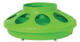
806 1 QT Plastic Poultry Feeder Base