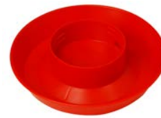
742 1 QT Screw-On Poultry Water Base