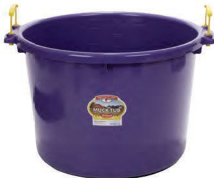
PSB70 70 QT Muck Tub