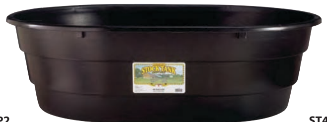
ST40 40 Gal Stock Tank