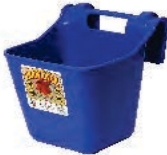
HF12 12 QT Fence Feeder