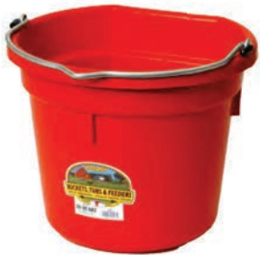
P20FB 20 QT Flat Back Bucket