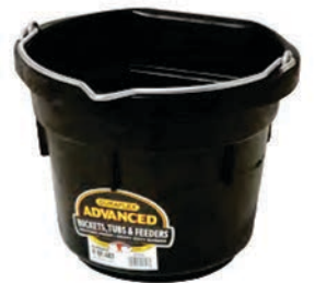
DF8FB 8 QT Rubber Flat Back Bucket