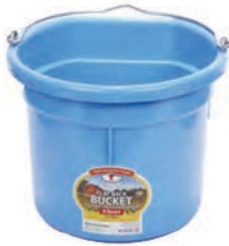
P8FB 8 QT Flat Back Bucket