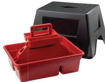
DTSS DuraTote Stool