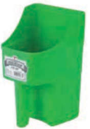
ENCS3 3 QT Plastic Feed Scoop