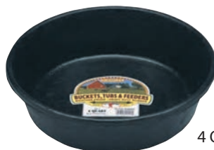
HP2 4 QT Rubber Feed Pan