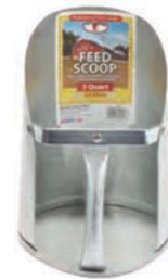
9203 3 QT Galvanized Feed Scoop