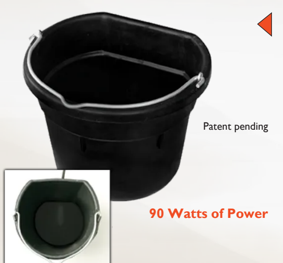
Totally concealed heating element