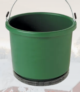
60 Watts of Power