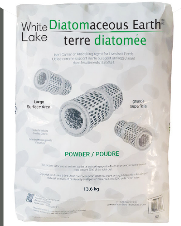
Natural Grade DE (Non-Calcined)