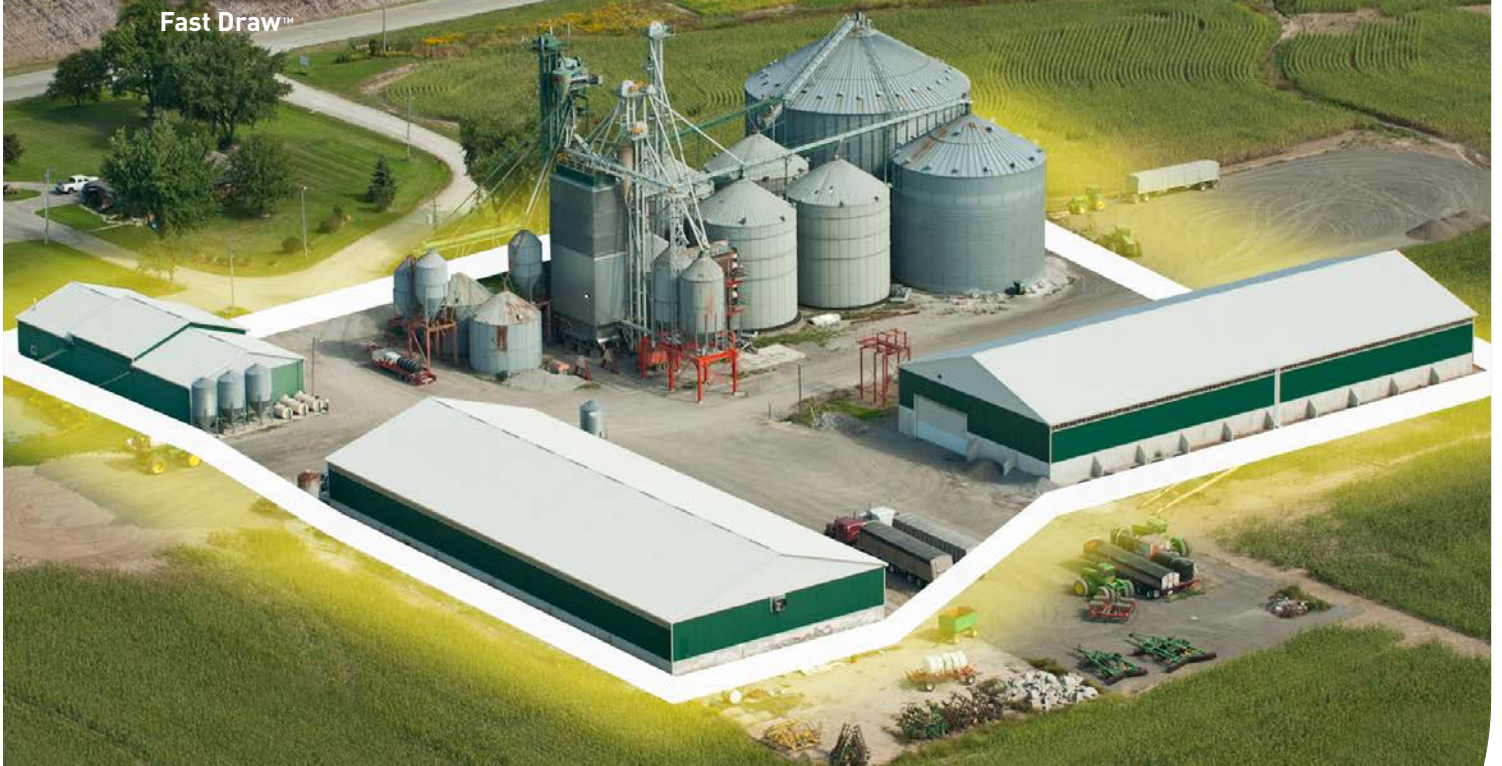
— Aegis® RP Station —