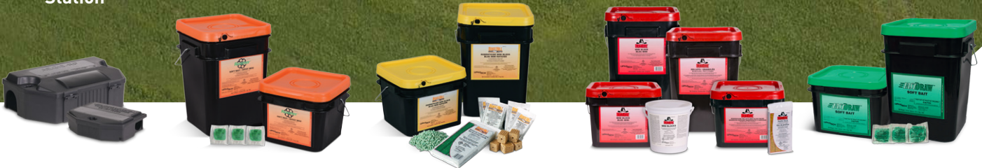
— Fast Draw™ —

Rodent control encompasses more than just technical solutions. Vetoquinol's innovative and lethal products confront rodent behaviour head-on. Our complete rodent program is a safe and easy way of controlling—and winning—the war against rodent infestation.