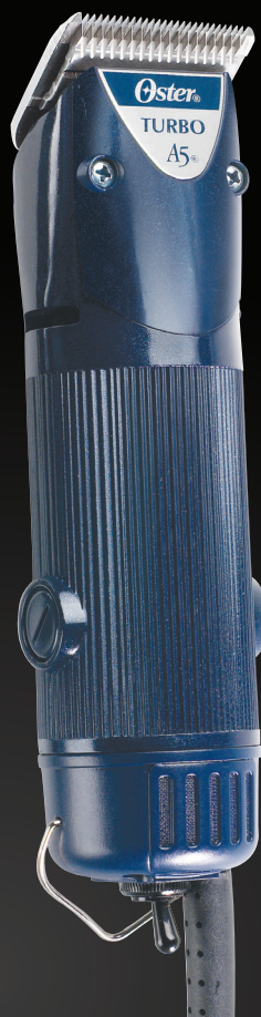
Turbo A5® Single Speed Clipper 78005-301-003