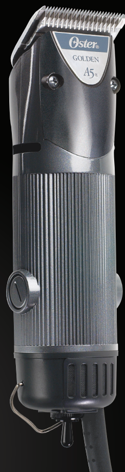
Golden A-5® Two Speed Clipper 78005-140-003