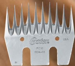
Shearmaster Blade PC10 2.5