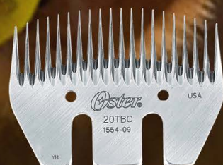
Shearmaster Blade 20 Tooth Comb