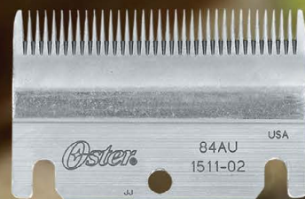
Clipmaster Blade 84AU