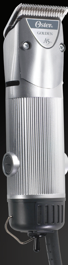
Golden A-5® Single Speed Clipper 78005-010-003