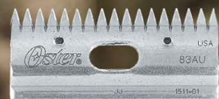
Clipmaster Blade 83AU