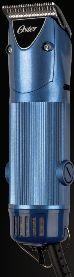
Turbo A5® Two Speed Clipper 78005-100-200