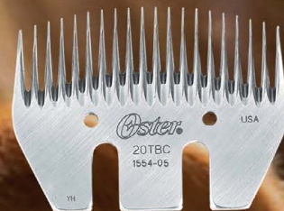
Shearmaster Blade P7112