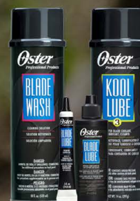
Kool Lube 14oz